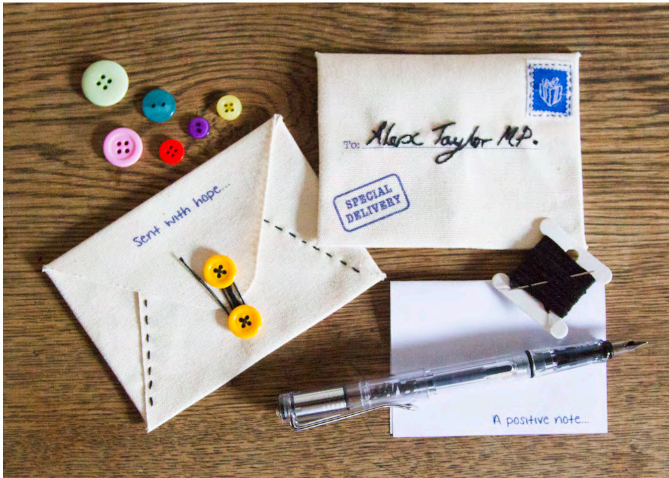
Craftivism Collective in collaboration with MIND mental health charity