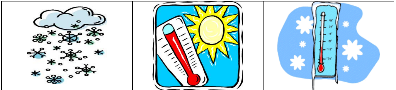
It's snowing ninge